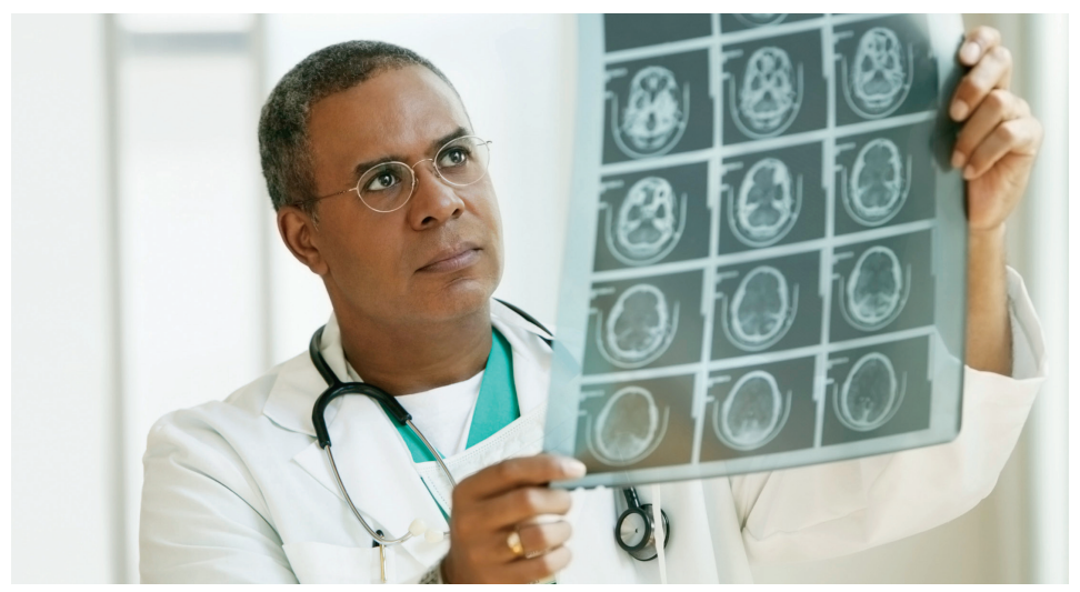
Doctors can do brain scans to check for some causes of memory problems.

In addition, the doctor may suggest a brain scan . Pictures from the scan can show normal and problem areas in the brain. Once the doctor finds out what is causing your memory problems, ask about the best treatment for you.