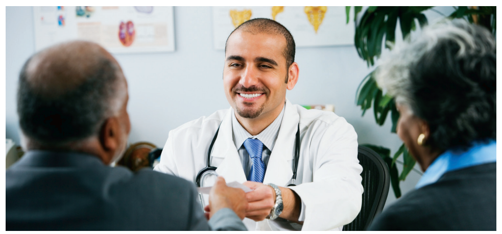
Talk with your doctor if you think you have a serious memory problem.

See your doctor if you are having any of the problems listed above. It's important to find out what might be causing a serious memory problem. Once you know the cause, you can get the right treatment.