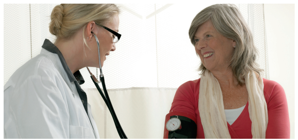
Get your blood pressure checked each time you see the doctor.