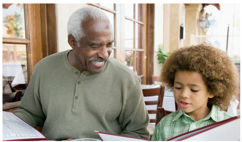
Spending time with friends and family may help.