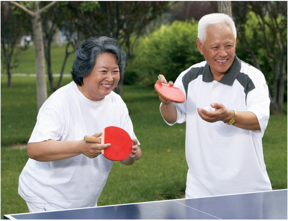
Being active can help you feel better.